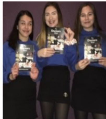
Y11 History students visited The Doctors Show in Horsham on 25th Jan