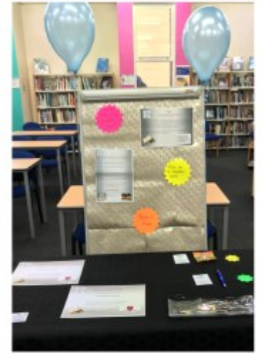
The Y10 Library Loyalty Card launched on 22nd Jan and we saw many new faces in the IL Library!